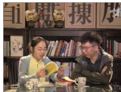
4. 幻聽 x 真人真事 - 19/11/2017