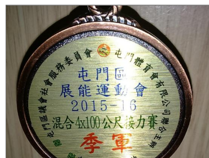
5. 新生資訊 (第廿九期) P.8-10