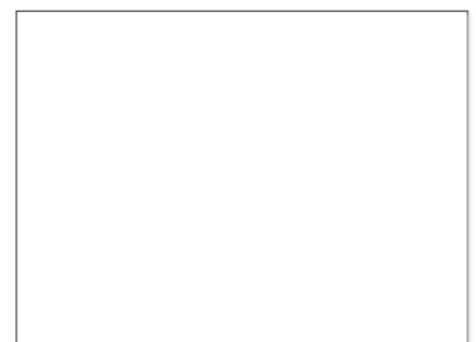
Urinary Incontinence Causes and Tre...