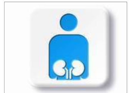
Surgical Treatment for Urethral Canc...