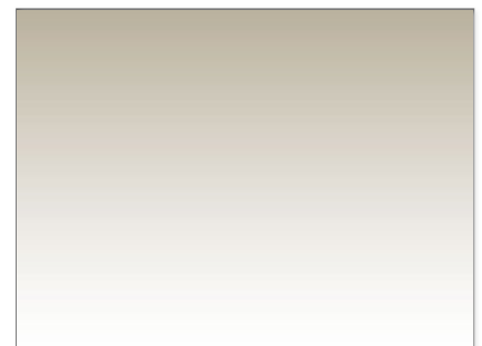
Surgery for Prostate Cancer