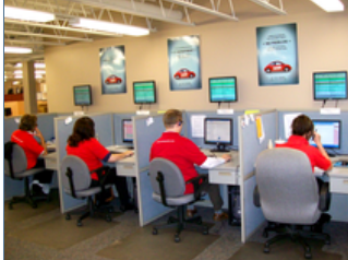
24/7 Client Support