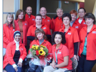
Dedicated Admin Team