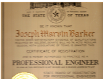
Professional Engineer Certification