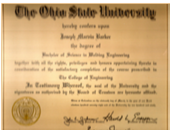
Engineer B.S. Degree