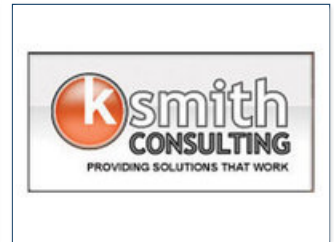
K Smith Consulting