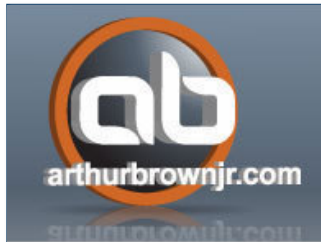
Arthur Brown Jr. logo