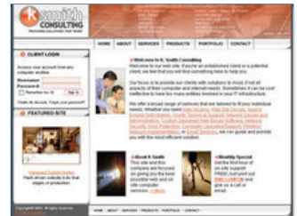
K Smith Consulting website