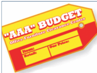
AAA Budget Office Furniture