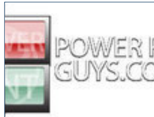
Power Point Guys