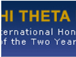
Phi Theta Kappa