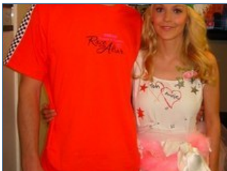
Our First Today Show Challenge...