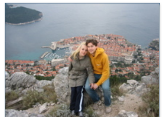
Way Above Dubrovnik, Croatia