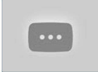
TODAY Show Intro Video