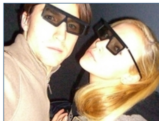
Don't Mess with 3D Glasses