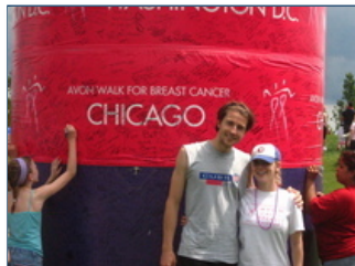
40 Miles Down, 1 Cure To Go.