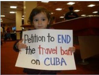
September 30th National Cu...