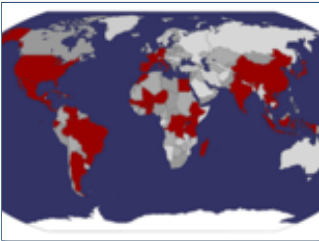
Countries where I have work...